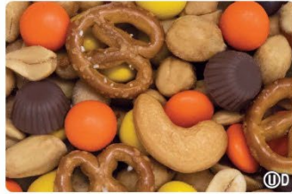
F Peanut Butter Trail Mix $7 UD

Milk chocolate bears with a smooth peanut butter filling. 6oz. Box