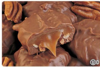
J Deluxe Pecan Clusters $8 UD

Cheese crackers, cheese corn sticks, mini pretzels, caramel cheddar corn puffs. 6.5oz. Bag