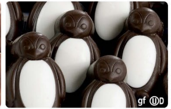
D Dark Chocolate Mint Penguins $7 gf UD

Fresh, milky caramel surrounded by smooth milk chocolate. 5.1oz. Box