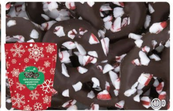
L Dark Chocolate Peppermint Pretzels $8 UD

The plumpiest raisins covered in smooth milk chocolate. 10oz. Poptop Can