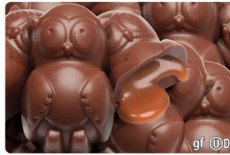
C Dulce de Leche Ovals $7 gf UD

Peanuts roasted with a touch of honey. 9oz. Poptop Can