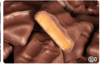
H English Butter Toffee $8 UD

Dark chocolate covered caramel topped with sea salt. 6oz. Box