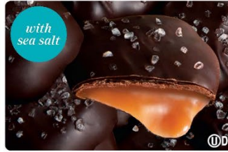
G Dark Chocolate Caramel Caps w/ Sea Salt $8 UD

Peanuts, peanut butter gems, peanut butter mini cups, mini pretzels and cashews. 7oz. Bag