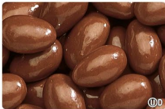
M Chocolate Covered Almonds $9 UD

Crunchy pretzels coated in rich dark chocolate and sprinkled with peppermint pieces. 6.5oz. Bag