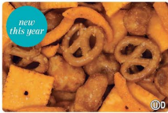
I Cheddar Caramel Crunch $8 UD

Crunchy handcrafted toffee drenched in milk chocolate. 6oz. Box