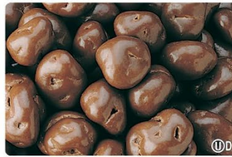
K Chocolate Covered Raisins $8 UD

Roasted pecans covered in caramel and milk chocolate. 5oz. Box