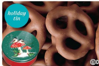
O Chocolate Covered Pretzels w/ Holiday Tin $11 UD

A classic favorite roasted and salted with sea salt. 8oz. Poptop Can