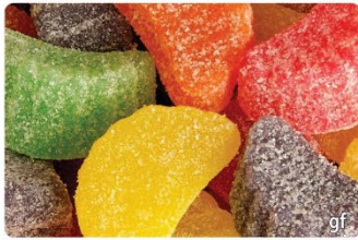
A Fruit Slices $7 gf

Fat free! Assorted naturally & artificially fruit flavored chewy candy. 10.5oz. Bag