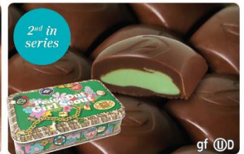
P Mint Treasures w/ Girl Scout Tin $12 gf UD

A favorite sweet and salty snack. Crunchy pretzels covered in smooth milk chocolate. 6.5oz. Holiday Tin