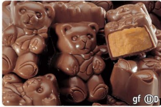
E Peanut Butter Bears $7 gf UD

Rich dark chocolate penguins bursting with frosty mint. 6oz. Box