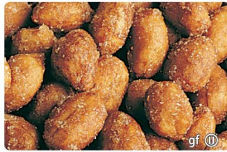
B Honey Roasted Peanuts $7 gf UD

Fat free! Assorted naturally & artificially fruit flavored chewy candy. 10.5oz. Bag