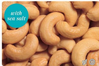
N Whole Cashews $10 gf UD

Crunchy almonds covered in milk chocolate. 10oz. Poptop Can